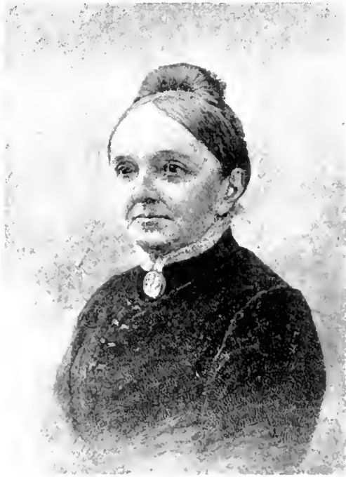
ROSE TERRY COOKE.

COOKE, Mrs. Rose Terry , author, born on a farm near Hartford, Conn., 17th February, 1827.